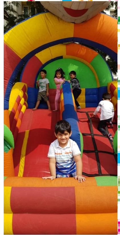
Children enjoying a day of treats, games and gifts!